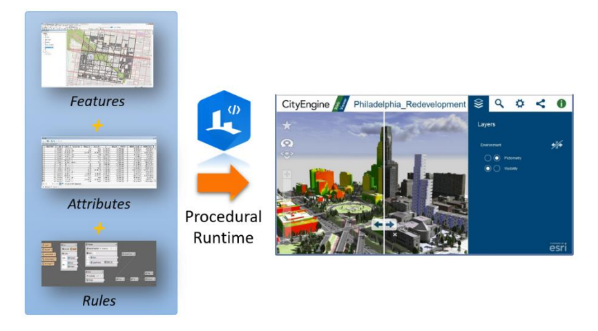
Figure 2 - The procedural generation process. Features (2D or 3D meshes) together with attributes and rules are used to procedurally create 3D models.

Figure 3 gives an overview of the runtime's software architecture. A client application (e.g. CityEngine [1]) invokes the runtime through the PRT API [2] whose key functionality is to trigger the procedural generation of 3D geometry which is performed by Shape Processing Units (SPUs [4]). In addition to the PRT API invocations, 3<sup>rd</sup> party software can hook into the generation process by extending the runtime through decoders, encoders and adaptors using the PRTX interfaces [3]. External resource access (e.g. for 3D models or textures) and caching is handled by the data backend [5]. The callback interface [6] closes the loop and communicates the generated 3D models back to the client application.